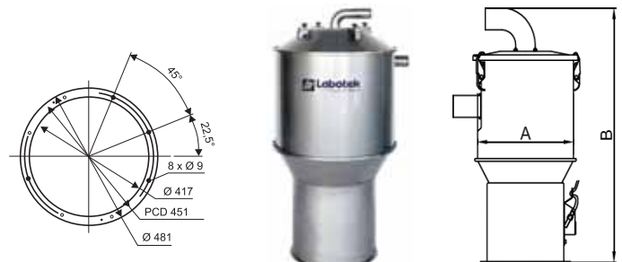
Mouting Pattern SVR 50-200 L Powder