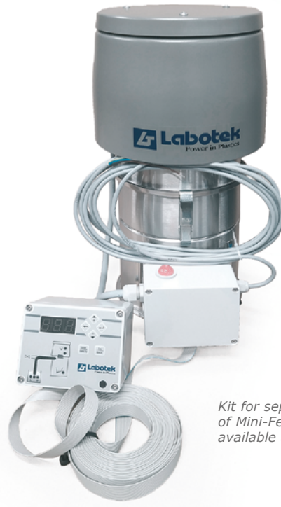
Kit for separate control of Mini-Feed 15-120 is available as an option.

In program P2, the Mini-Feed will perform timed conveying from the grinder to the production machine.